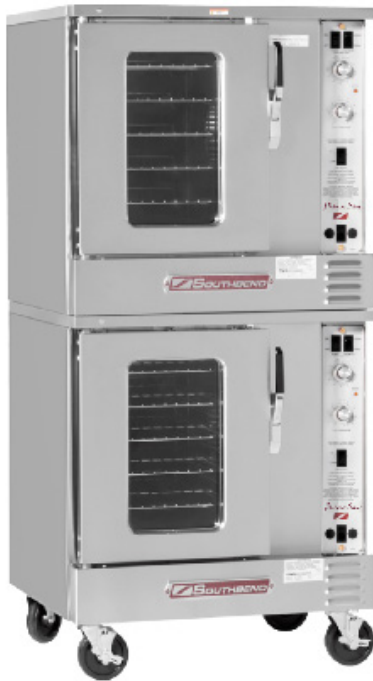
PCHG60S/S shown with optional casters